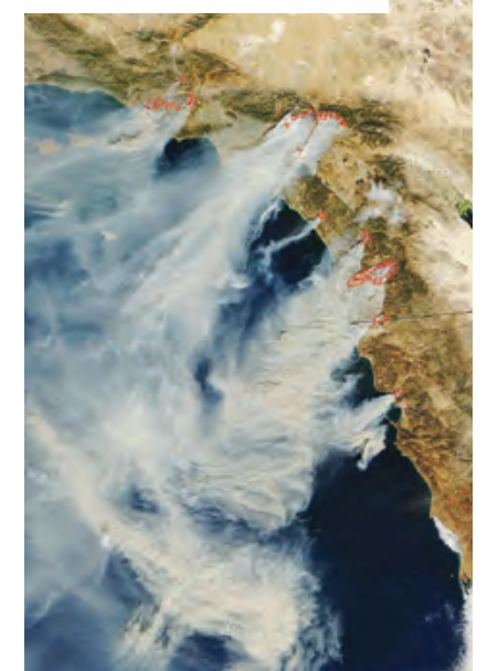
Massive wildfires burning across Southern California: October 25, 2003

The California example: California has kept up with the average warming of the planet by about 0.9 degrees Celsius, with regions such as the Central Valley warming in excess of 2 degrees Celsius. This warming melts the snowpack, and the dark surface underneath absorbs more heat and therefore increases moisture loss by 7–15 percent per degree of warming. This amplified drying becomes chronic, since the warming gets worse each year due to increase in emissions of warming pollutants. The chronic drying is drastically magnified into a mega-drought when rainfall decreases sporadically due to variability in the weather, similar to what has happened over the past four years. The resulting extreme drying of the soil and vegetation contributes to fires. The forest fires, in turn, emit more CO 2 as well as black carbon and methane, the two largest contributors to warming next to CO 2 . This phenomenon is not confined to California. Similar problems are occurring throughout western North America. The melting of northern latitude permafrost and resultant increases in methane emissions are another potential feedback element in warming driven by similar patterns.